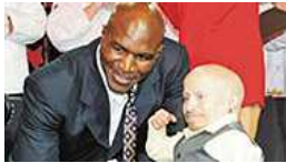
• Broward | Palm Beach County