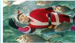
• See them in water and on land