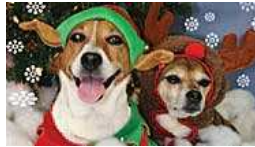
• Dress up the pup; share pics