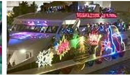
• 38th annual floating parade