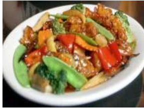
Best Chinese Food