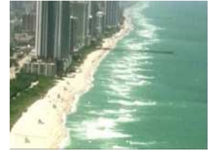
Cheap Fun Things To Do