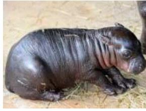
Baby Hippo On Display