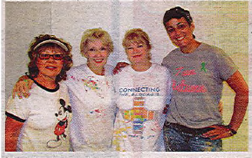
Attendees were in the painting mood at the ChildNet fundraiser.

For information about ChildNet, call 954-414-6000.